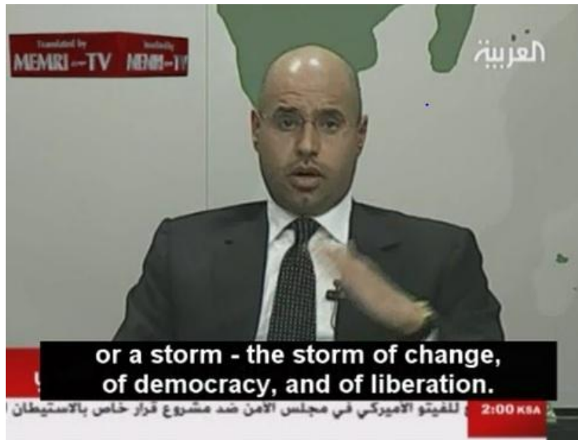
Seif Al-Islam Al-Qadhafi, Libyan Leader's Son